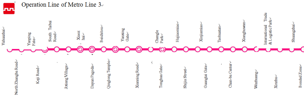
Figure 1: Metro Line 3 Site Distribution

North Zhangba Road Station of Metro Line 3 is located at the east of the intersection of Fuyu Road and North Zhangba Road, stretching from east to west along Keji Road. Vanguard Supermarket and resident communities are on the northeast corner of the intersection, and city shops, Urban Impression, Miro & Blue Mountain and other commercial & residential communities are on the southeast. Current width of Keji Road is 40m and the width within the boundary line of North Zhangba Road is 60m, with heavier traffic. The surroundings are planned as residential land. Bus traffic at the intersection of North Zhangba Road Station accounts for 4.12% of vehicle flow quantity and 16 bus lines are set here in total. The detailed bus line profile is shown as Table 1.